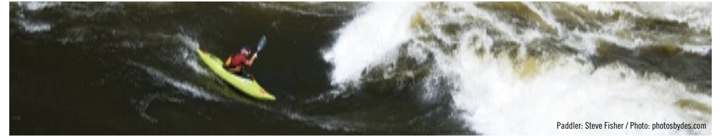
Paddler: Steve Fisher