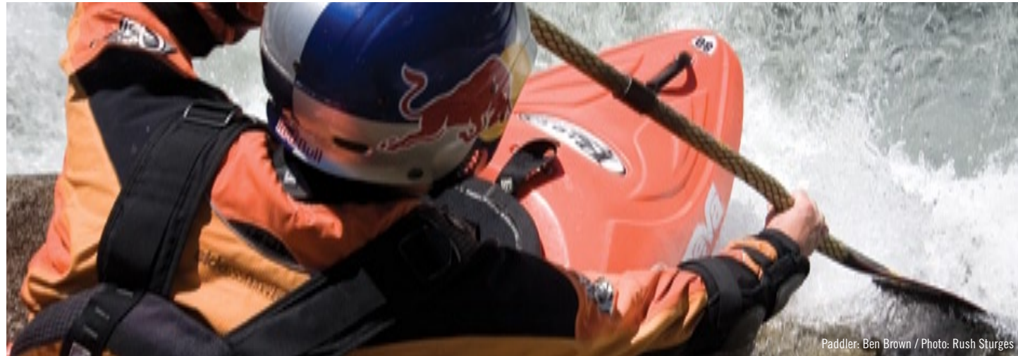
Paddler: Ben Brown