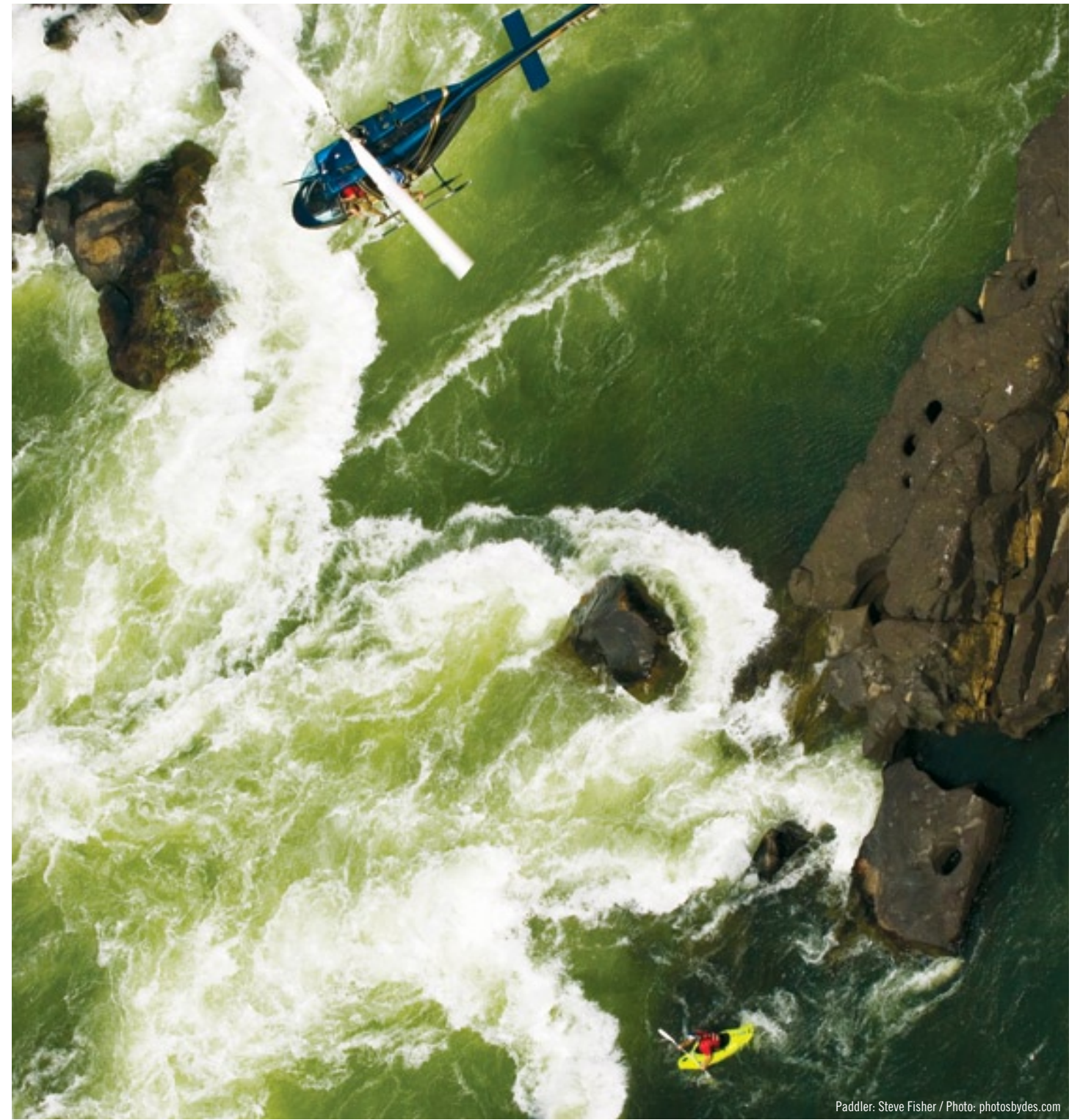
Paddler: Steve Fisher